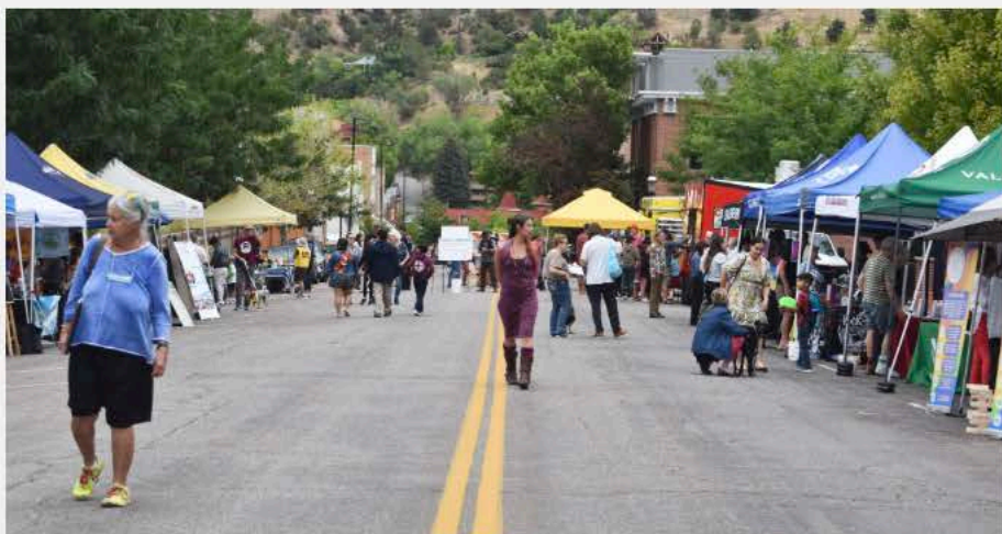
The Nonprofit Volunteer Fair was crowded on Wednesday afternoon in Glenwood Springs.

The Nonprofit Volunteer Fair in Glenwood Springs on Wednesday afternoon drew a strong turnout, offering tacos and doughnuts to people interested in giving back to local organizations.