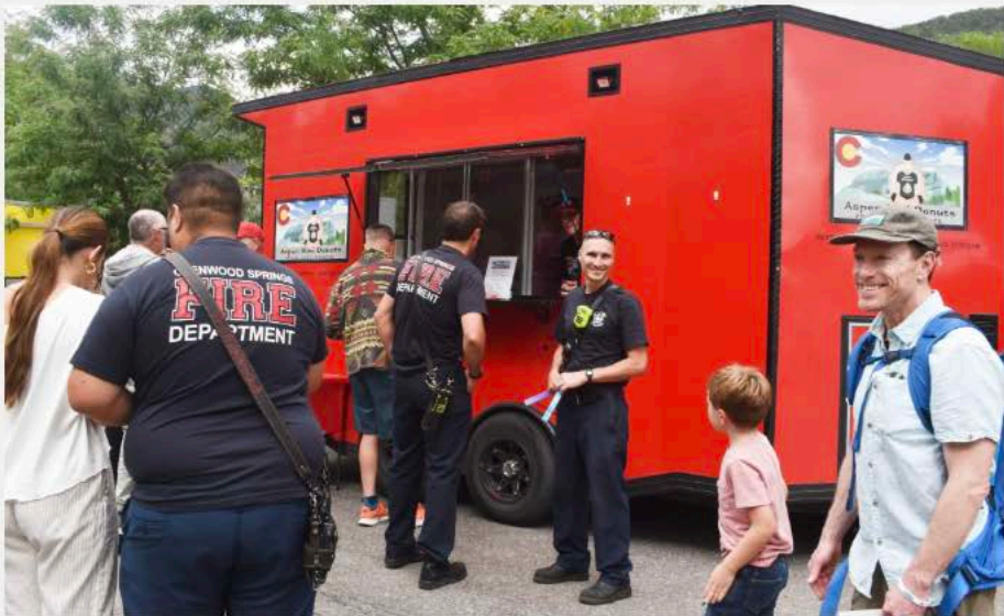
Glenwood Springs firefighters mingled with the crowd and bought doughnuts from Aspen Mini Donuts during the Nonprofit Volunteer Fair on Wednesday afternoon in Glenwood Springs.