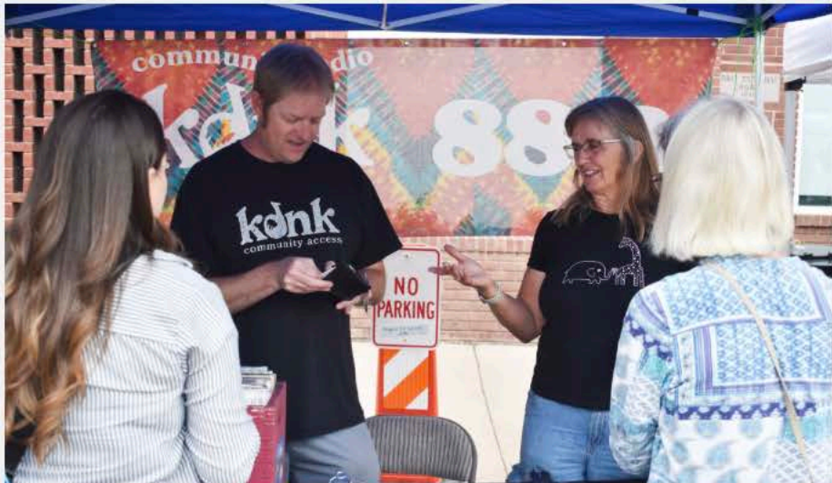
KDNK booth members spoke with patrons and handed out business cards during the Nonprofit Volunteer Fair on Wednesday afternoon in Glenwood Springs.