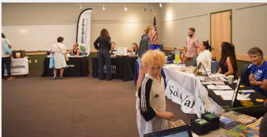
The Glenwood Springs Branch Library hosted media outlets from around Garfield County, including the Sopris Sun, Aspen Public Radio, Sol del Valle, Aspen Journalism, the Aspen Times and others, during the Nonprofit Volunteer Fair on Wednesday afternoon in Glenwood Springs.

Organized by Aspen Public Radio, the fair featured WindWalkers in Carbondale, Literacy Outreach, English in Action, Colorado Animal Rescue and several others.