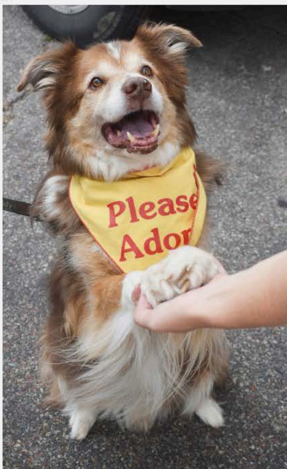
Colorado Animal Rescue brought several dogs available for adoption, including Otis, an 11-year-old described as very friendly, to the Nonprofit Volunteer Fair on Wednesday afternoon in Glenwood Springs.