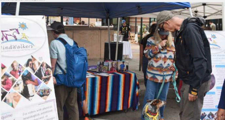
WindWalkers, a Carbondale nonprofit that provides equine therapy for people with disabilities and trauma survivors, took part in the Nonprofit Volunteer Fair on Wednesday afternoon in Glenwood Springs.